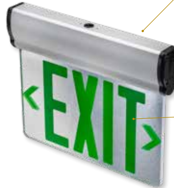
Sleek Extruded Brushed Aluminum Housing