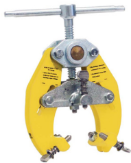
1-2.5" ULTRA™ Qwik Fit