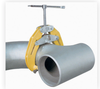
Fit up 90° fittings to tee