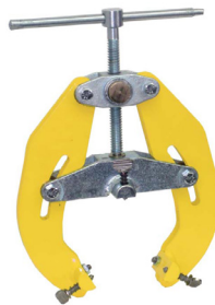
2-6" ULTRA™ Qwik Fit