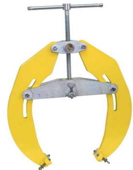
5-12" ULTRA™ Qwik Fit