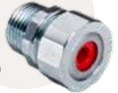
Cable Chart for Flexible Cord Connectors