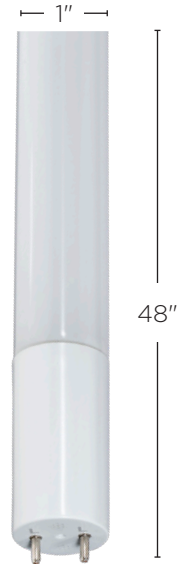
G13 Bi-pin Base