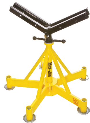
781460 MAX JAX* Basic