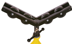
Rubber Wheel Kit (PN 781394)