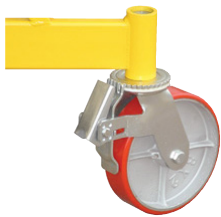
Roller Wheel Caster Kit (PN 781465)