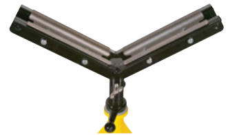
Stainless Steel Sleeves (PN 781382)