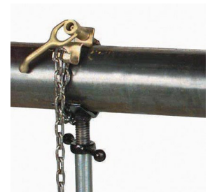
Hold Down Device (PN 781050)