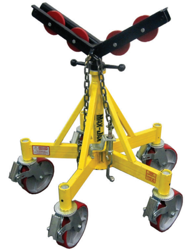
781403 MAX JAX* Kit