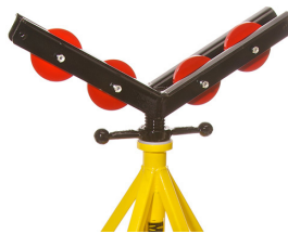
Stainless Steel (781407) or Aluminum (781406) Roller Head Kit