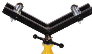
Ball Transfers (PN 781383)