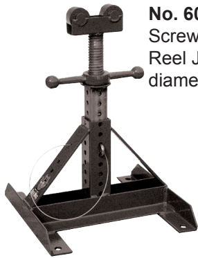
No. 60 (Part # 780941) Screw-type Telescoping Reel Jack for 26 to 56" diameter reels.