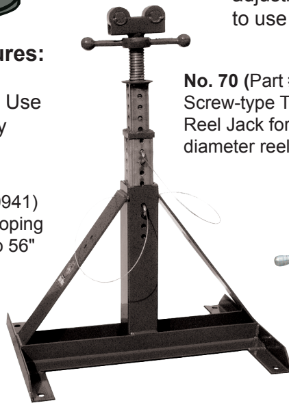
No. 70 (Part # 780942) Screw-type Telescoping Reel Jack for 46 to 96" diameter reels.