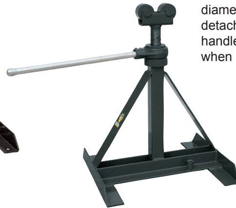
No. 80 (Part # 780943) Heavy Duty Ratchet Drive Reel Jack for reels up to 90" in diameter. Convenient, detachable ratchet handle stores in base when not in use.