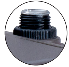
Integrated dusk-to-dawn photocell*

Functional Life (L70): 50,000 Hours Location Rating: Wet IP Rating: IP65 Ambient Operating Temperature: -40°F to 122°F Mounting: Wall Mount, typical for mounting heights up to 30'