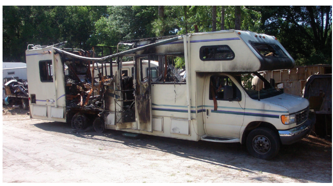
PROTECT AGAINST THE DANGERS OF ELECTRICAL FIRES.