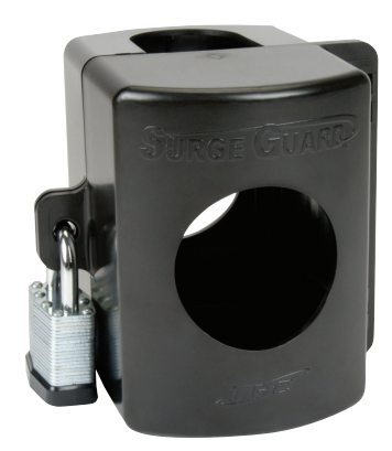
Lock not included