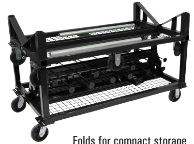
Hanger Mac II (Part # 785651)