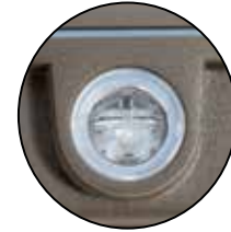
Integrated dusk-to-dawn photocell*

Input Voltage, Frequency: 120-277V, 50/60Hz Power Factor, THD %: >0.9, <20% Dimming: 0-10V down to 10% 1 Efficacy: Up to 140 LPW Minimum CRI: 84 IES Distribution: Type III Functional Life (L70): 50,000 hours Location Rating: Wet IP Rating: IP65 IK Rating: IK10 Ambient Operating Temperature: -40°F to 113°F