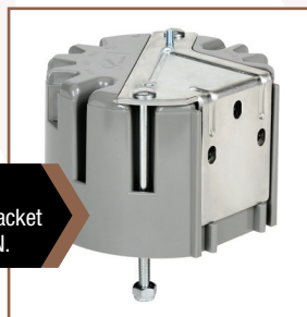
MSBRND Inset shows added bracket to upgrade to MSBFAN.