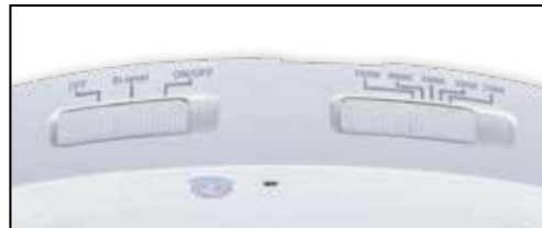
Motion sensor and CCT selectable switches