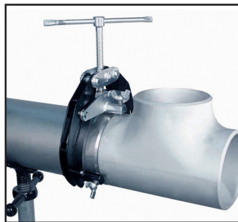
Pipe to tee