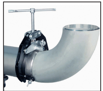
Pipe to fitting