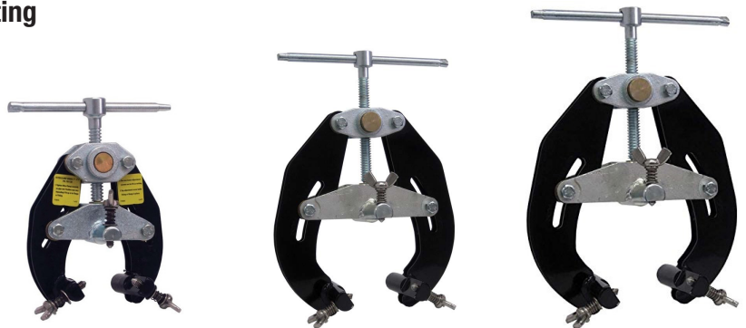
1-2.5" ULTRA™ Qwik Clamp