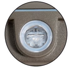
Integrated dusk-to-dawn photocell*

Functional Life (L70): 50,000 hours Location Rating: Wet IP Rating: IP65 IK Rating: IK10 Ambient Operating Temperature: -40°F to 113°F