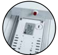
EM PUSH TO TEST BUTTON