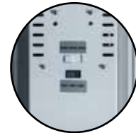
POWER &amp; CCT SELECTABLE SWITCH